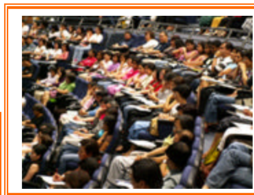
○ Catechist Seminar @ CJC