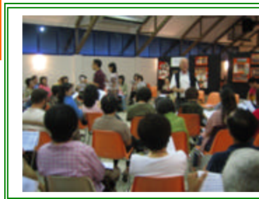
○ Brother Ghislain of Taize leading the participants in the chanting – "Singing "Taize style" can be likened to lectio divina ."